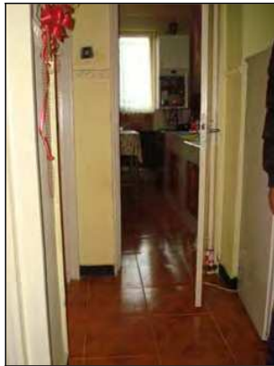
Interior view of the corridor