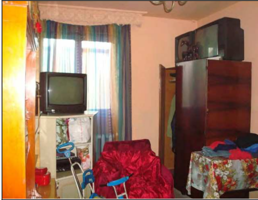
Interior view of the 1 st bedroom