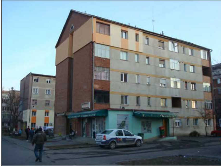
Exterior view of the building