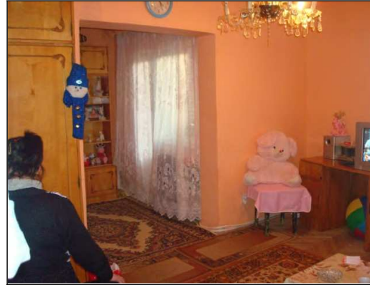
Interior view of the living area