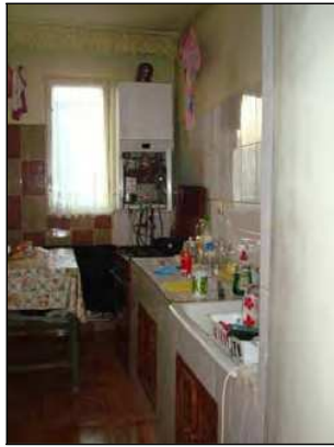
Interior view of the kitchen