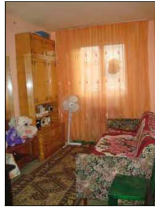
Interior view of the 2 nd bedroom