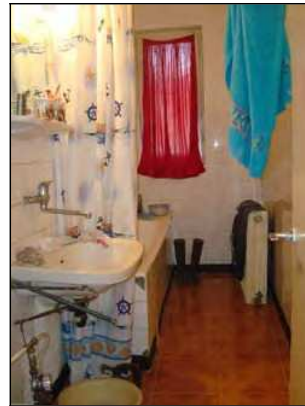
Interior view of the bathroom