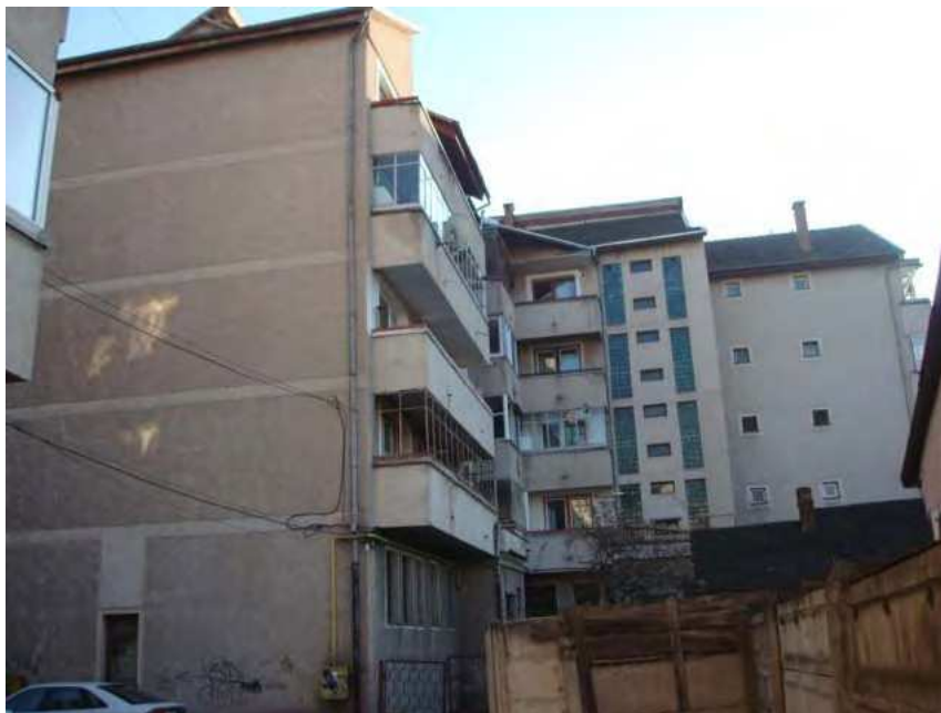
Exterior view of the building