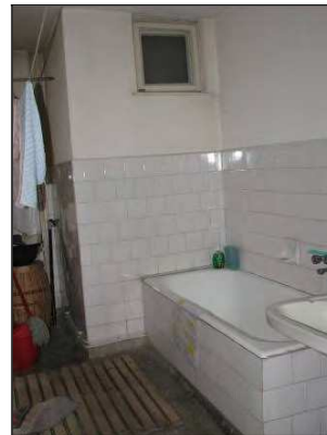
Interior view of the bathroom