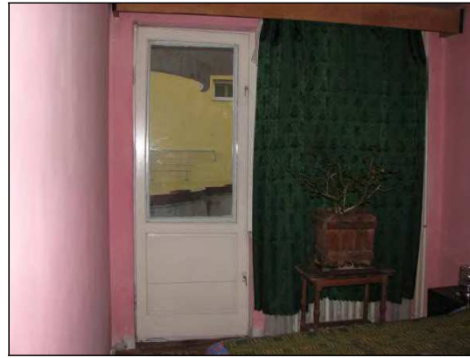
Interior view of the 1 st bedroom