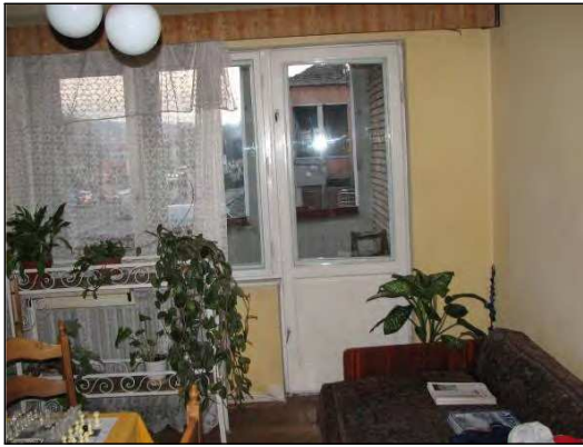
Interior view of the living area