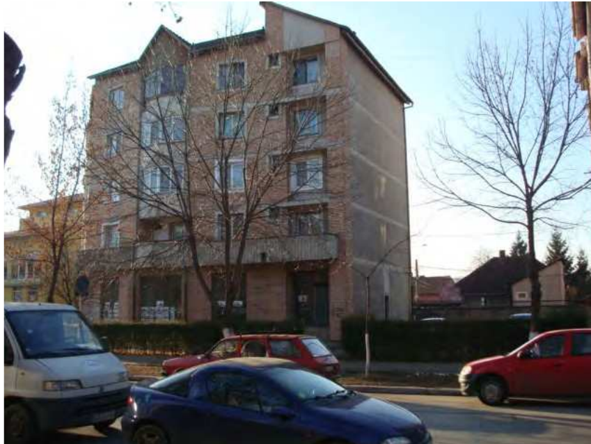
Exterior view of the building