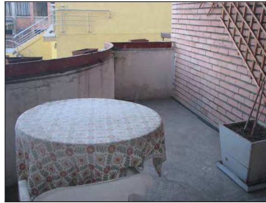
View of the balcony