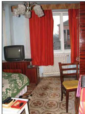
Interior view of the 2 nd bedroom