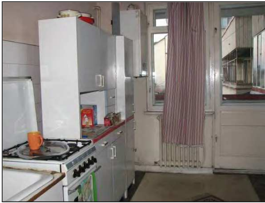
Interior view of the kitchen