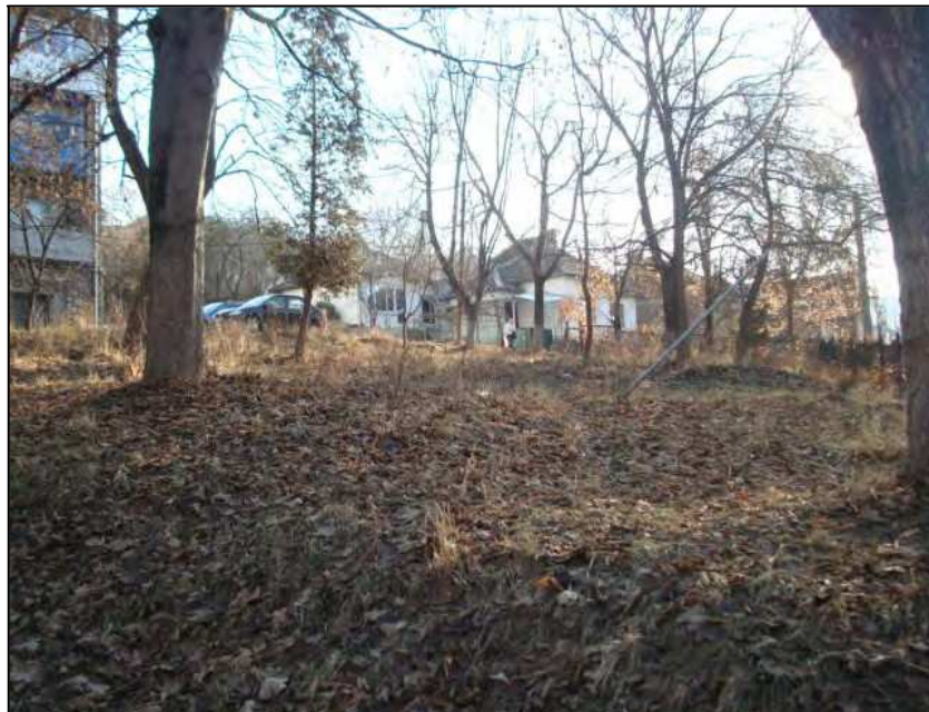
Exterior view of the land