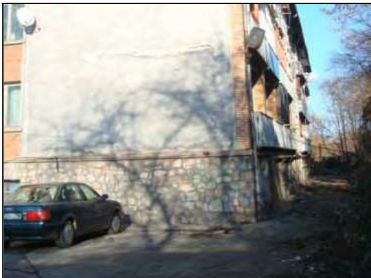
View of the land at the rear side of the building