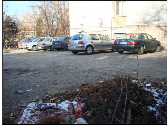
View of the poorly surfaced car park