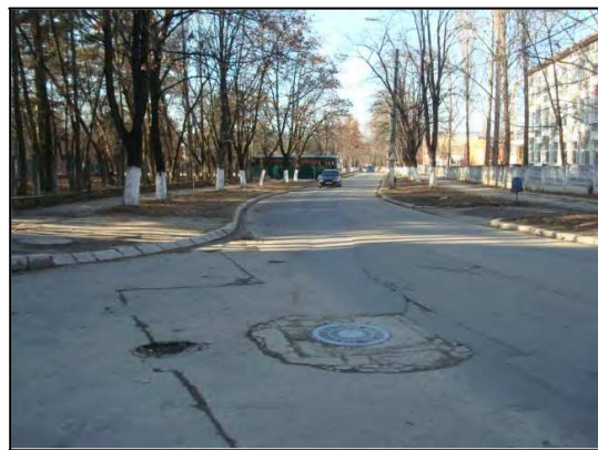
View of the concrete access road