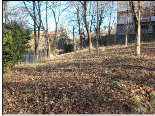
View of the sloped land