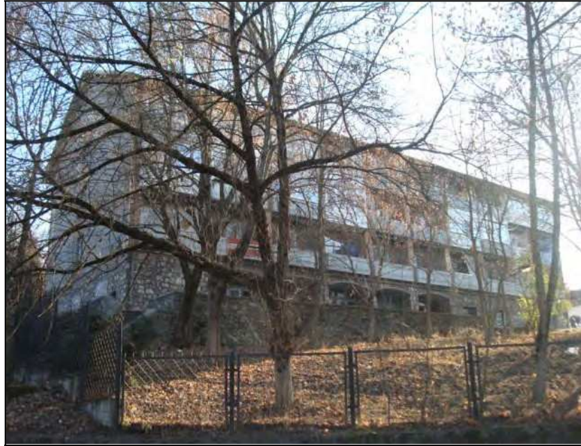
Exterior view from outside the property on Bulevardul 1848