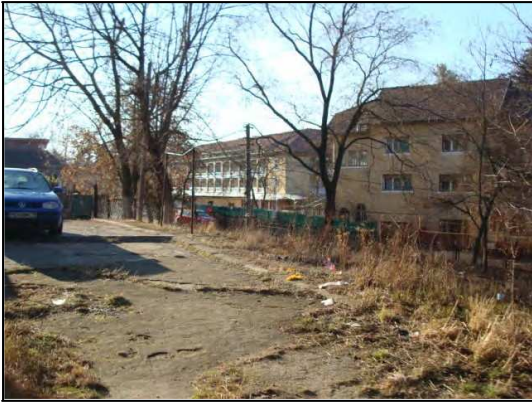
View of the poorly surfaced car park